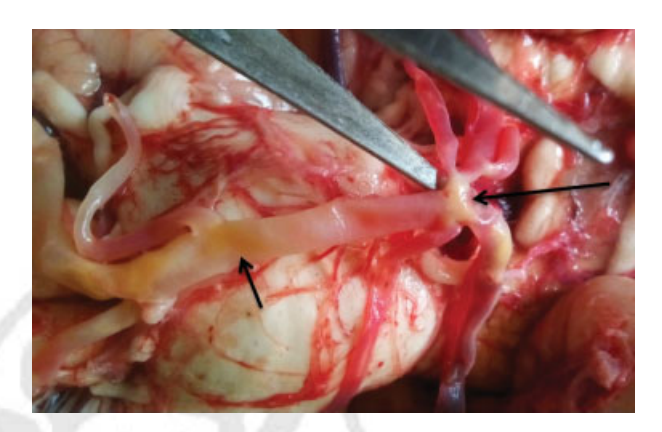
Fig. 4 Atherosclerosis of the basilar artery. Arrows point to parts with atheromatous plaques. Note: the terminal end trifurcates and the right superior cerebellar artery shares a common trunk with the posterior cerebral artery (longer arrow).